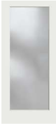
FO7002WBLE | Ovolo 6'8" WaterBarrier® Technology, 3/4" Insulated Glass with Low-E

With WaterBarrier® and UltraBlock® Technologies – 5 Year warranty, no building overhang required.