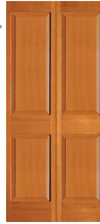
FO43RBI | Bifold 3/4" Raised Panel