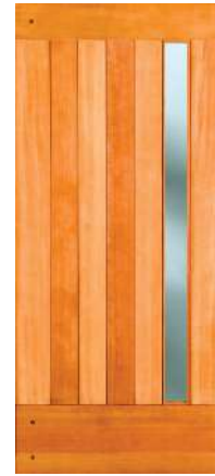
4974L | Shaker 6'8" & 8'0" 1-3/4", 3/4" Insulated Glass