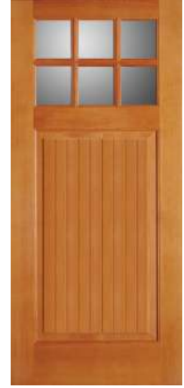
FO7228 3/4" Insulated Glass