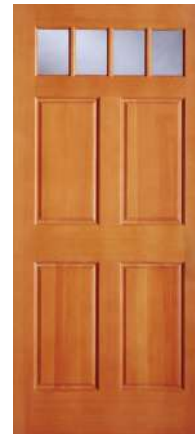
FO7134 | Ovolo 1-7/16" Innerbond® Raised Panel, 3/4" Insulated Glass