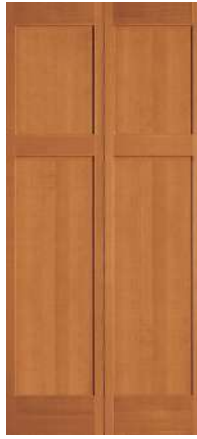
FS700BI | Bifold Square Sticking 1/2" Flat Panel