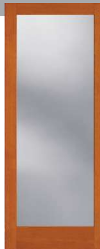
CO1501C | Ovolo 8'0" 1/8" Single Glazed