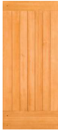
4972 6'8", 8'0" 1-3/4"