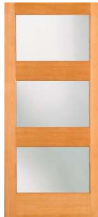
F7403 | Shaker 6'8" 1-3/4", 3/4" Insulated Glass