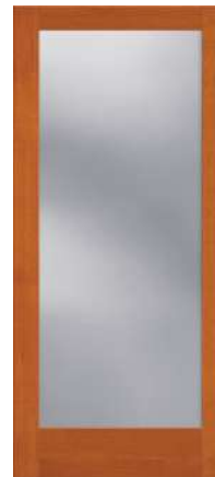
FS1501C | Shaker 1/8" Clear Single Glazed