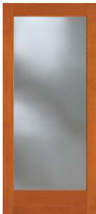
CO1501C | Ovolo 6'8" 1/8" Single Glazed

5-1/2" Stiles 5-7/16" Top Rail 11-3/16" Bottom Rail