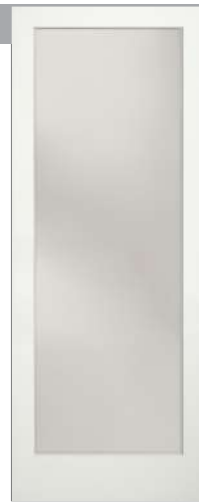
PO8001 | Ovolo 8'0" 1/8" Single Glazed