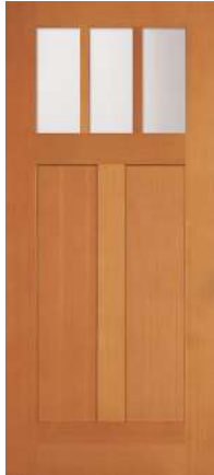
FS36803FP | Shaker 3/4" Clear Insulated Glass