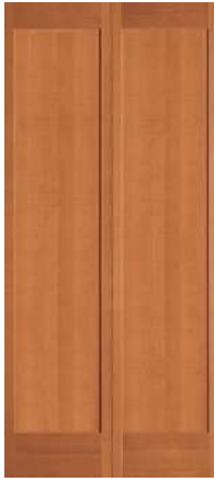
701BI | Bifold Square or Ovolo 1/2" Flat Panel

701 & 702 Available in both Square or Ovolo or Sticking