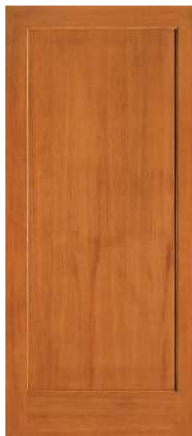
FOSP1 3/8" Flat Panel

**Available in both Square or Ovolo Sticking