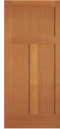
FSSH3 3/8" Flat Panel