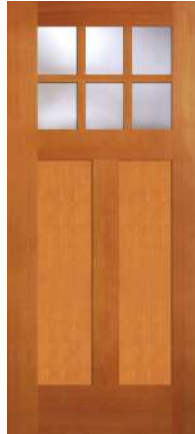
FS7662FP | Shaker 3/4" Flat Panel, 3/4" Insulated Glass