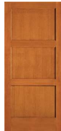
FOSP3E 3/8" Flat Panel