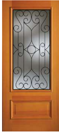
FO6490 | Santa Fe 3/4" Wrought Iron Insulated Glass

Doors come with UltraBlock® technology – 5 Year warranty