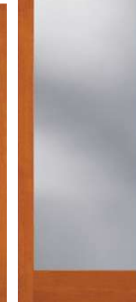
FS1501C | Shaker 8'0" 1/8" Clear Single Glazed