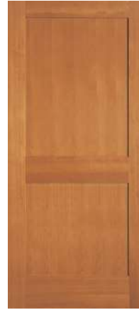
FSSH2 3/8" Flat Panel