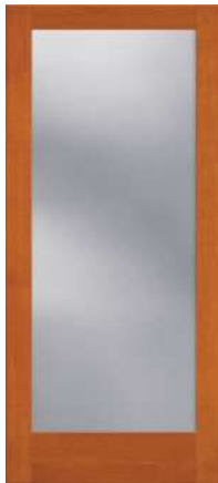
FO1501 | Ovolo 1-3/4" x 6'8" 1/8" Single Glazed