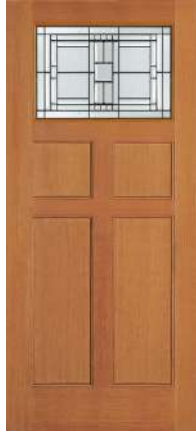
FO6366 | Portsmouth® 3/4" Black, Insulated Glass

1-3/4" Douglas Fir Doors 3'0" x 6'8" with 3/4" Flat Panel.