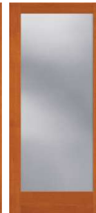
FS1501WL | Shaker 1/4" White Lami Glass