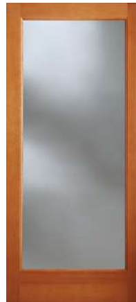
FO7001 3/4" IG with UltraBlock® Technology