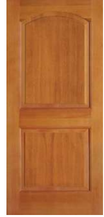
FO465R 3/4" Raised Panel