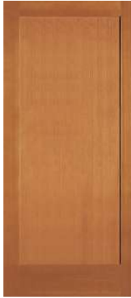
FSSH1 3/8" Flat Panel

Standard Douglas Fir, 1-3/4" Door 5-7/16" Stiles with 3/4" Panels