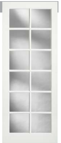
PO8012 | Ovolo 8'0" 1/8" Single Glazed