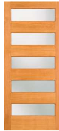
F7405 | Shaker 6'8" 1-3/4", 3/4" Insulated Glass