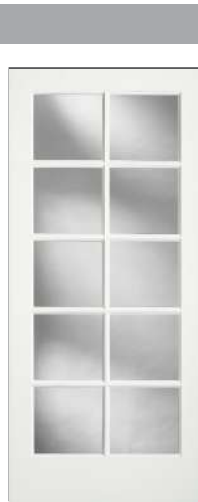
PO8010 | Ovolo 1/8" Single Glazed