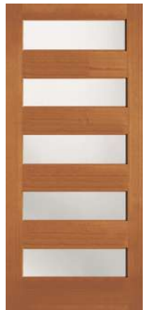
FS1605WL | Shaker 1-3/8" White Lami