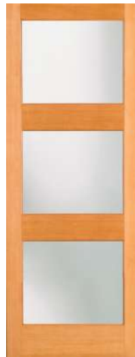
F7403 | Shaker 8'0" 1-3/4", 3/4" Insulated Glass