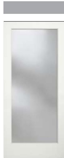
PO8001 | Ovolo 1/8" Single Glazed

Primed, 1-3/8" thick, Single Glazed Compression Clear TDL Glass