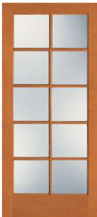
FO1310 | Ovolo 1/8" Clear Single Glazed

Douglas Fir, 1-3/8" thick Single Glazed Glass, unless otherwise noted