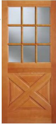
FO2035 | Ovolo 3/4" Raised Panel, 1/8" Clear Single Glazed

Standard Douglas Fir, 1-3/4" thick, Ovolo and Shaker Sticking as noted, Single Glazed & Insulated Glass as noted.