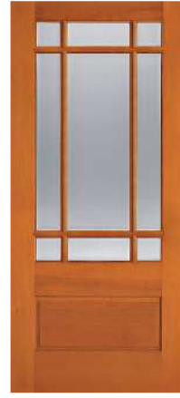
FO7598 | Bellaire® Ovolo 3/4" Beveled Insulated Glass