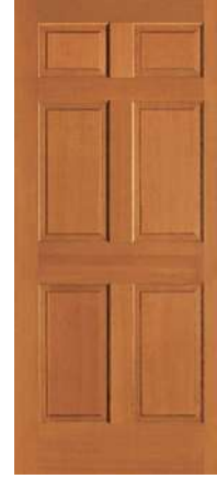
FO66R 3/4" Raised Panel