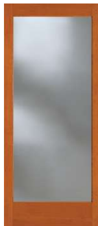
CO1501C | Ovolo 7'0" 1/8" Single Glazed