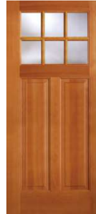
FO7662RP | Ovolo 1-7/16" Innerbond® Raised Panel, 3/4" Insulated Glass