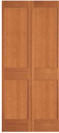
702BI | Bifold Square or Ovolo 1/2" Flat Panel