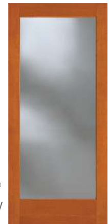
7002LEADA 6'8" 7'0" 8'0" 3/4" Insulated Glass

Available in both Ovolo & Shaker style Doors come with UltraBlock® technology – 5 Year warranty