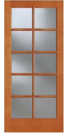
FO7010 | Ovolo 3/4" Clear Insulated Glass with UltraBlock® Technology