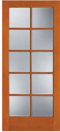
FO1510C | Ovolo 1/8" Clear Single Glazed,