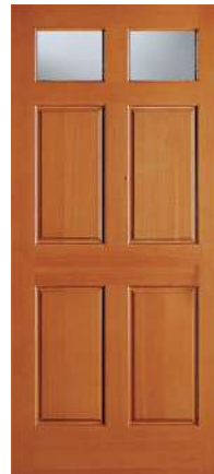
FO7132 | Ovolo 1-7/16" Innerbond® Raised Panel, 3/4" Insulated Glass