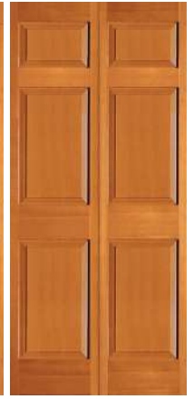
FO63RBI | Bifold 3/4" Raised Panel