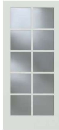
FO37010WBLE | Ovolo 6'8" WaterBarrier Technology, 3/4" Insulated Glass with Low-E