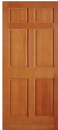
FO7130 1-7/16" Innerbond® Raised Panel