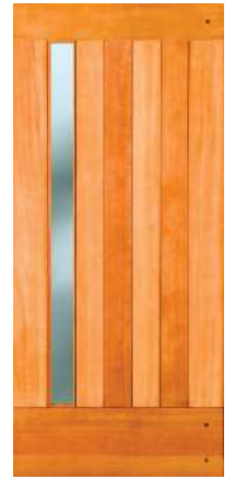
4974R | Shaker 6'8" & 8'0" 1-3/4", 3/4" Insulated Glass