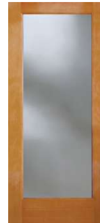
FO7002LE 3/4" IG with Low-E and UltraBlock® Technology