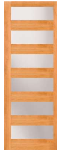
F7406 | Shaker 8'0" 1-3/4", 3/4" Insulated Glass