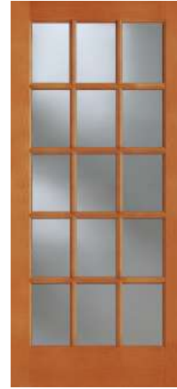
FO7015 | Ovolo 3/4" Clear Insulated Glass with UltraBlock® Technology