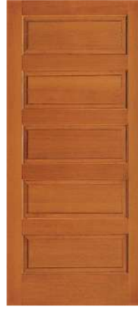
FO55R 3/4" Raised Panel