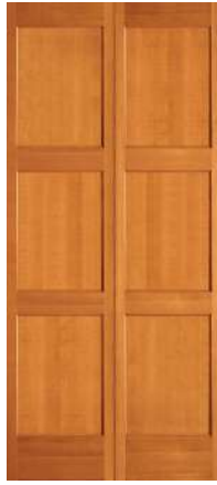
FOSH3EBI | Bifold Ovolo Sticking 3/8" Flat Panel