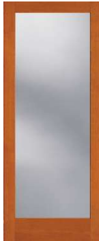
FO1501 | Ovolo 8'0" 1/8" Single Glazed