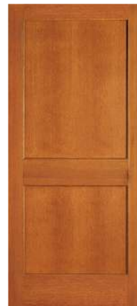
FOSP2 3/8" Flat Panel