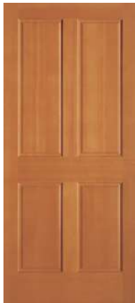
FO7344 1-7/16" Innerbond® Raised Panel

1-3/4" Douglas Fir, Raised Panel Doors 3/4" TDL Clear Glass