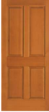
FO44R 3/4" Raised Panel

Standard Douglas Fir, 1-3/4" thick, 5-1/2" Stiles (Include 3/8" ovolo sticking)