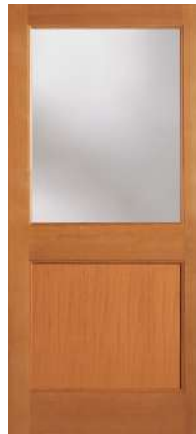
FO7081 | Ovolo 3/4" Flat Panel, 3/4" Insulated Glass