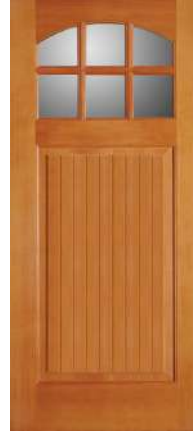
FO7218 3/4" Insulated Glass

Doors come with UltraBlock® technology – 5 Year warranty